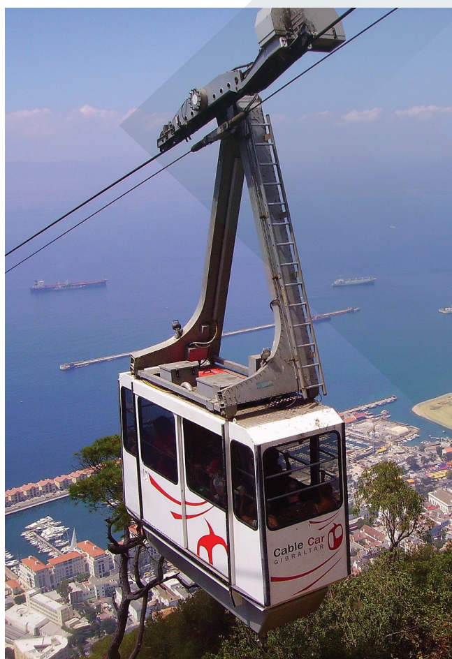
Gibraltar Cable Car.

From facilitating accommodation searches to pet relocation services, a wide array of support options exists to streamline the relocation process, making it similar to a local move