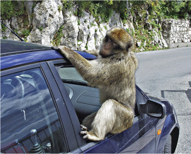
Gibraltar's Baboons.

Here's a glimpse of what our publication covers: