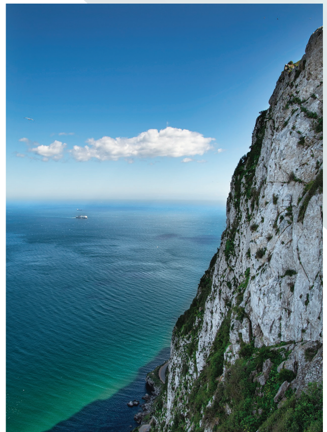
The Rock of Gibraltar.

With a comprehensive approach, this guide ensures that you're equipped with all the knowledge and resources needed to make your relocation to Gibraltar a seamless and fulfilling experience. ▲