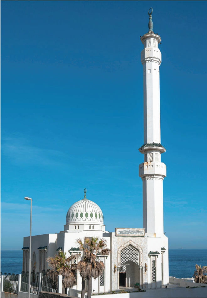
Ibrahim-al-Ibrahim Mosque.

In sum, Gibraltar exemplifies an area where diverse religious traditions peacefully intersect.